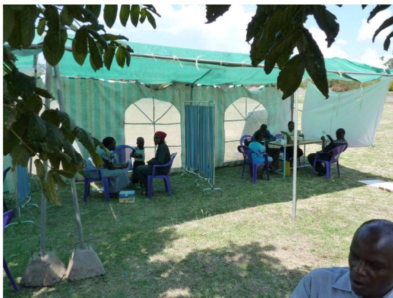
Photo 1. Counseling in session at the VCT tent during the World AIDS Day 2010 celebrations

Currently there are two fulltime trained VCT counselors in the site offering quality services to the clients.