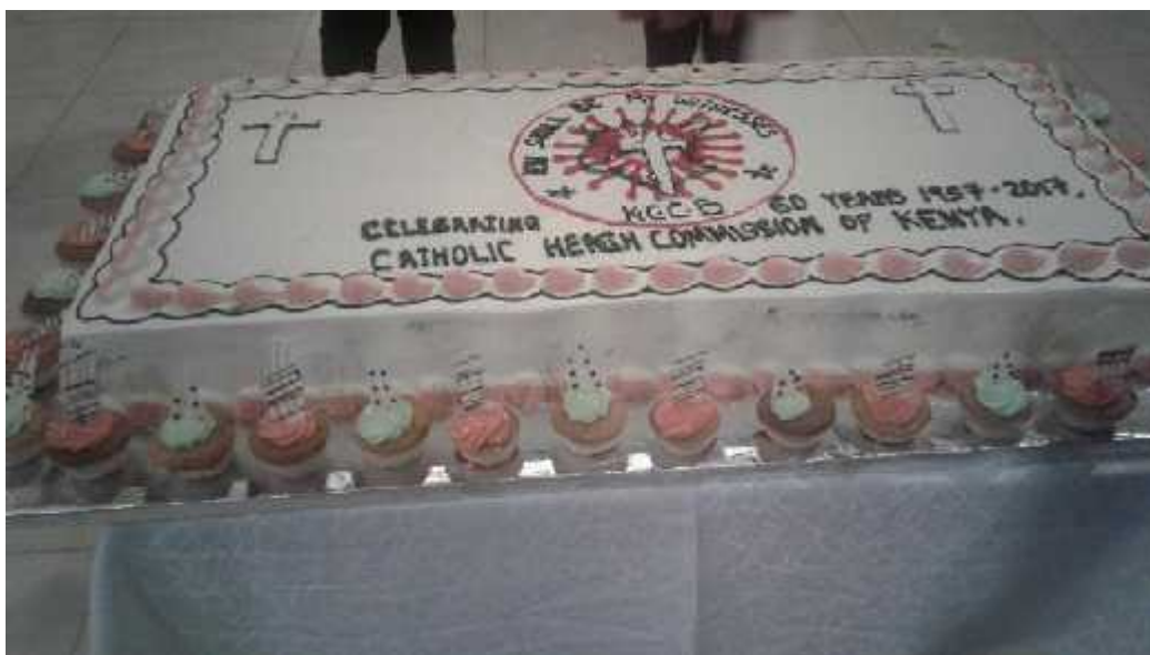
A 5kg Cake marked 60 years of KCCB in Kenya