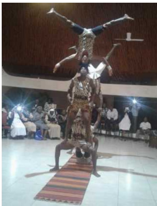
Acrobats entertaining delegates during 60 th KCCB Anniversary