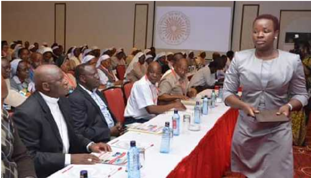
Hon. Minister for Health, Dr. Cleopa Mailu (second from left) during the sessions.

thus depriving NHIF opportunity to serve health institutions effectively in the interest of value for money.