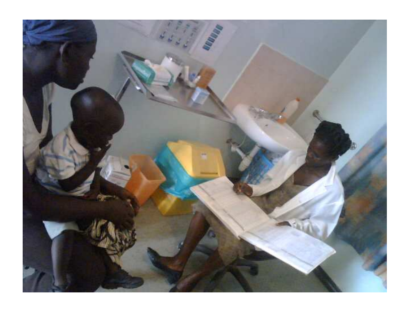
VCT counselor entering client data in the register after testing