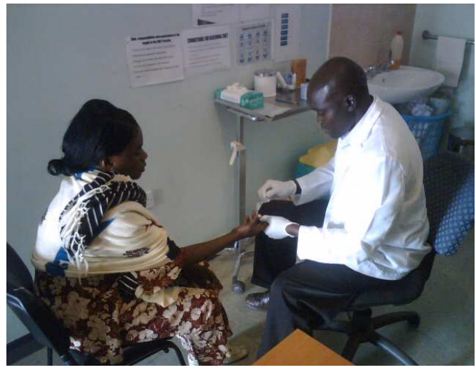
Testing of a client after counseling

St Camillus VCT site has two trained counselors offering quality services to their clients.