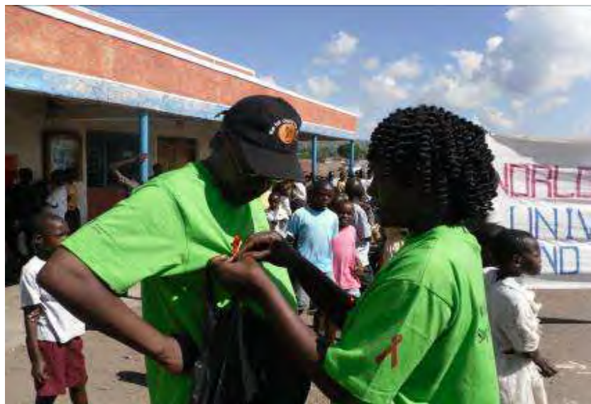
Hope and Life provides a healthy and supportive for PLWHA such as organizing a march and ribbons for World AIDS Day.