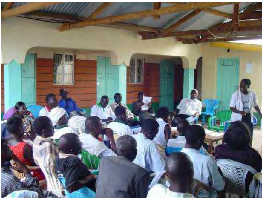
Hope and Life Team Members leading a discussion on Living Positively to a Community Group.