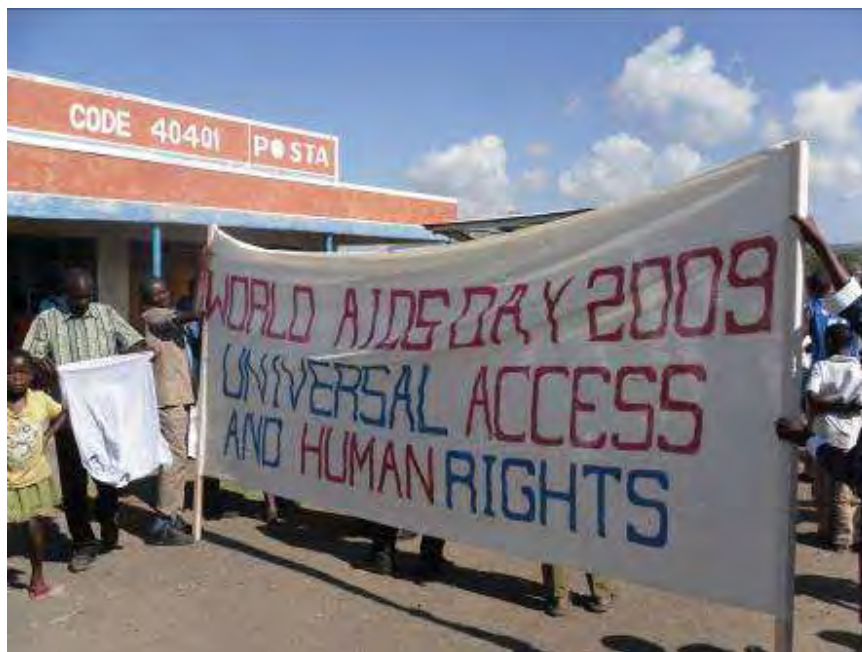
Hope and Life played a vital role in organizing and coordinating World AIDS Day 2009 in Karungu.