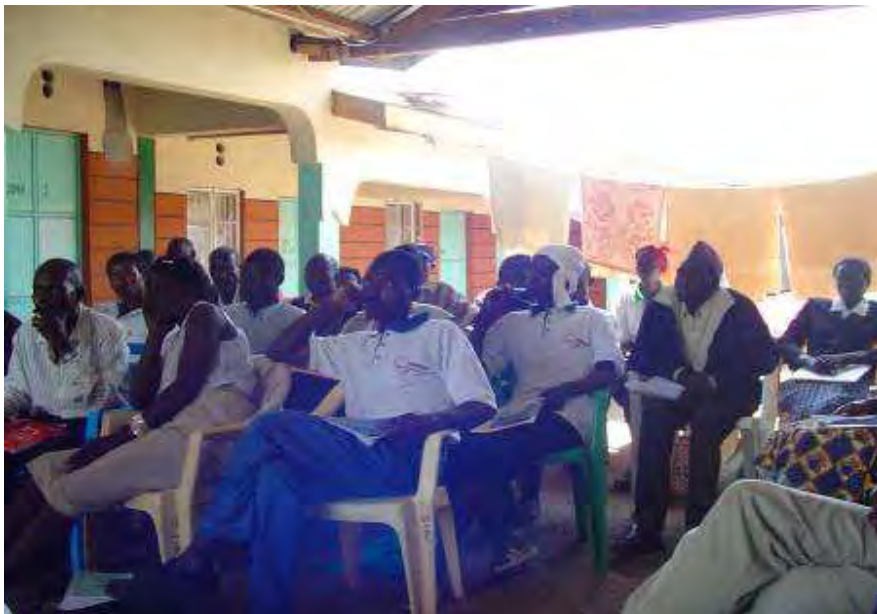
Hope and Life collaborates with other organizations such as AMREF to coordinate trainings and lectures.