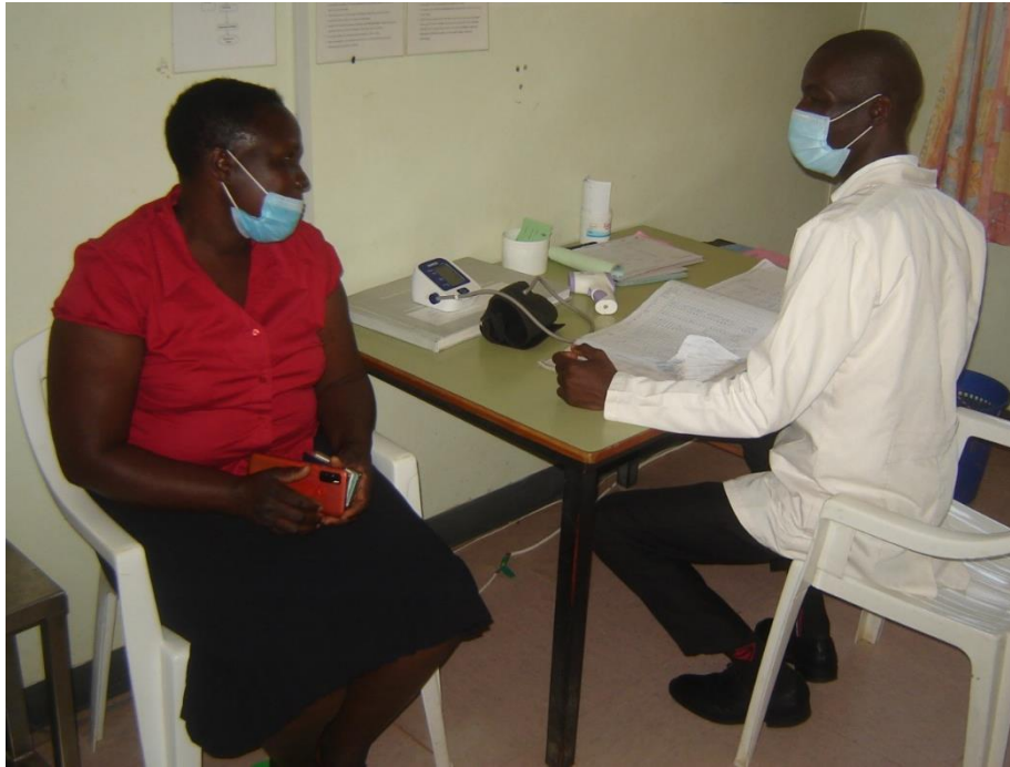
A Counselor screening a client for HIV testing at the OPD